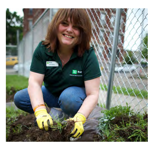
TD Green Streets volunteer

Toronto Park People received funding from TD to help develop the TD Park Builders Program , which encourages community engagement in local green spaces in Toronto's low-income, newcomer and high-needs neighbourhoods. In 2014, the first year of the program, TD Park Builders supported 13 projects – including planting and gardening programs, park events and park improvements – that are helping communities turn their green spaces into vital neighbourhood hubs.