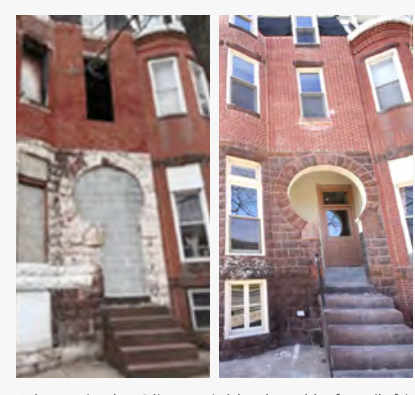
A home in the Oliver neighborhood before (left) and after (right)

East Baltimore's historic Oliver neighborhood suffered years of disinvestment and economic decline. The community is part of a multi-phase revitalization initiative developed by The Reinvestment Fund to create affordable housing. TD Bank has invested over $2.2 million through the federal Low-Income Housing Tax Credit ("LIHTC") program to support this active project.